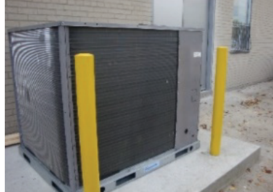
Project Type: Optical Research Facility