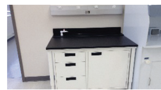
Project Type: Academic Teaching Facility