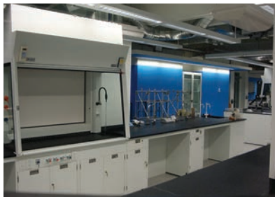
Project Type: Chemistry Research Laboratory