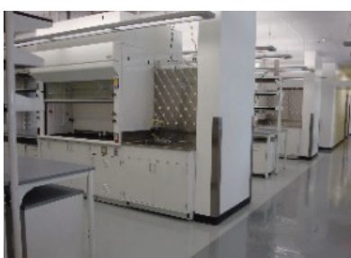
Project Type: Wet/Dry Research Laboratory